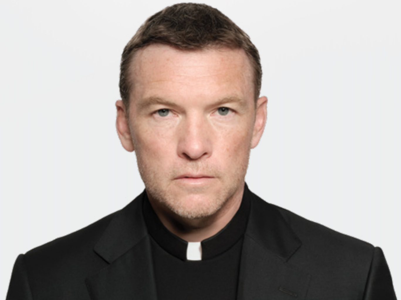
Pamela Rabe, Sam Worthington